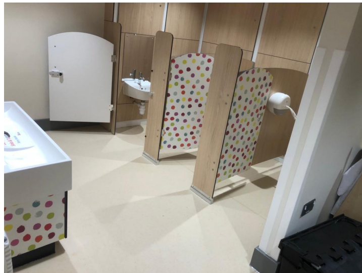
This is a picture of the toilets.