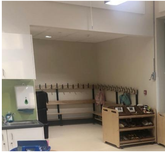
This is where you can hang your coats and bags up to keep them safe.